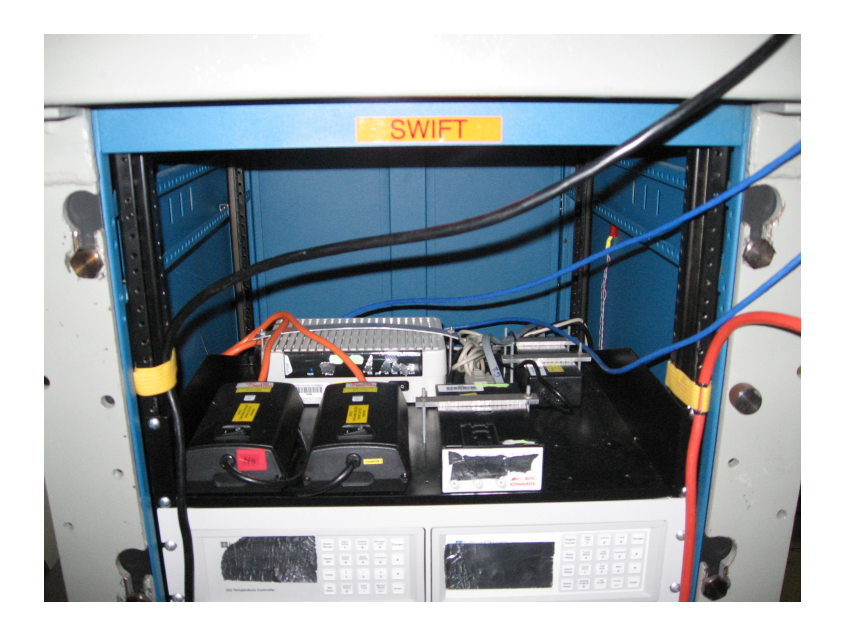
Figure 2: Top shelf of electronics rack with out cables. Showing Arc lamp power supplies, terminal server and pressure monitor. Power cables (orange and black) and network cables (blue) can be seen going off to connections on the other side of the cage.