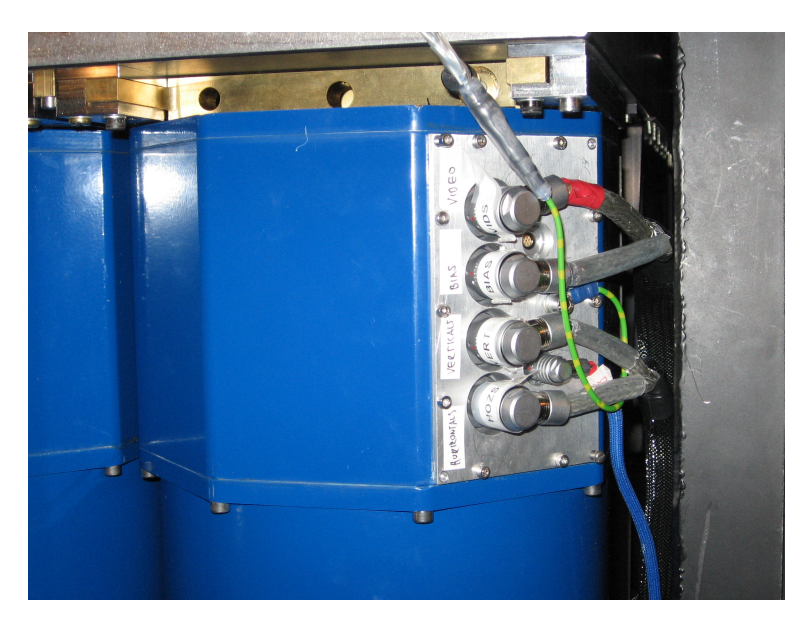
Figure 6: Detector connector panel showing CCD cables installed. The grounding plug is the yellow-green wire.

N.B. Using a clip lead between the cryostat eletrical plate and controller would be a sensible precaution during this process; and it's easy to attach. A wrist strap clipped to the controller housing would be helpful to avoid doubt.