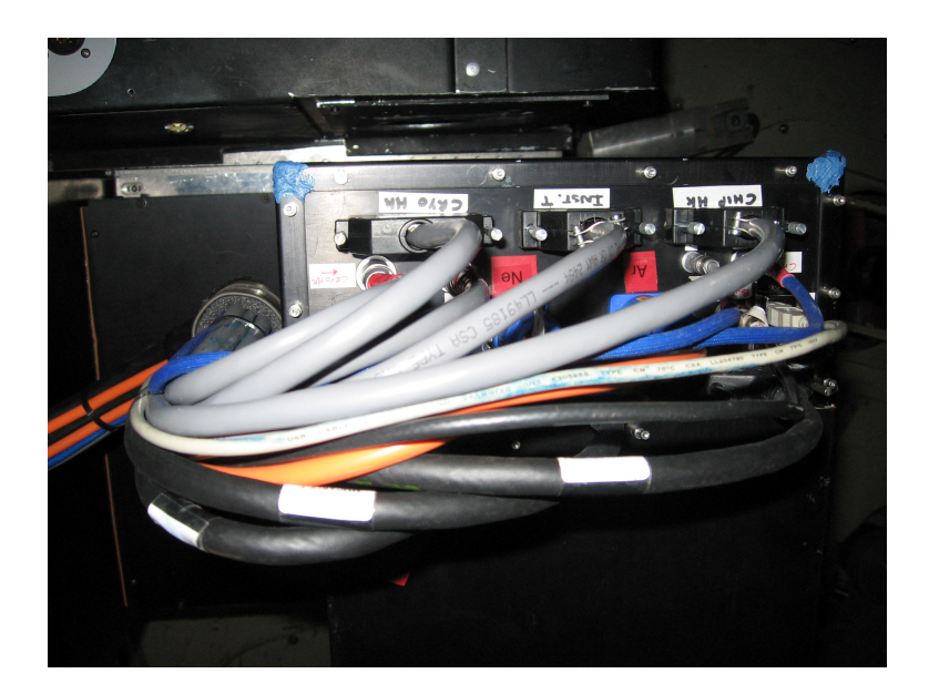
Figure 5: View of the cables installed at the pre-optics end of the instrument (taken from the cass cage floor). The foam padded strain relief clamp is just visible around the cable of the left. It is secured to the preoptics plate with (**check^{**}) \#8-32 screws.