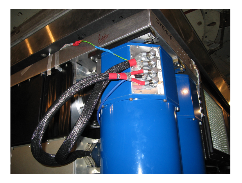
Figure 7: Detector cables installed. The grounding plug is the yellow-green wire.