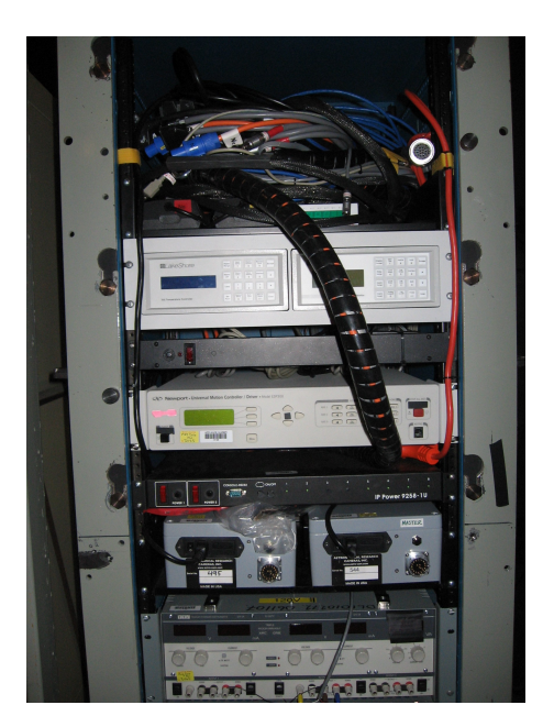
Figure 1: SWIFT electronics rack with umbilical cable coiled on top of upper shelf. From top to bottom, the electronics are 1) (under cables; see figure 2) Arc lamp power supplies, terminal server, pressure monitor, 2) Lakeshore 218 and 325, 3) Power strip 4) Motor controller 5) Network power supply 6) SDSU power supplies 7) general power supply

rack and identify most of the components. The instrument is connected to the rack with an large "umbilical" cable which carries the majority of the cables. The umbilical also carries a number of cables which connect the back end of the instrument (i.e. cryostats) to the main patch panel at the front end (preoptics) of the instrument. The power cables for the SDSUs are separate to the umbilical, as are the CCD optical fibers and imaging camera network cables, which don't go to the rack.